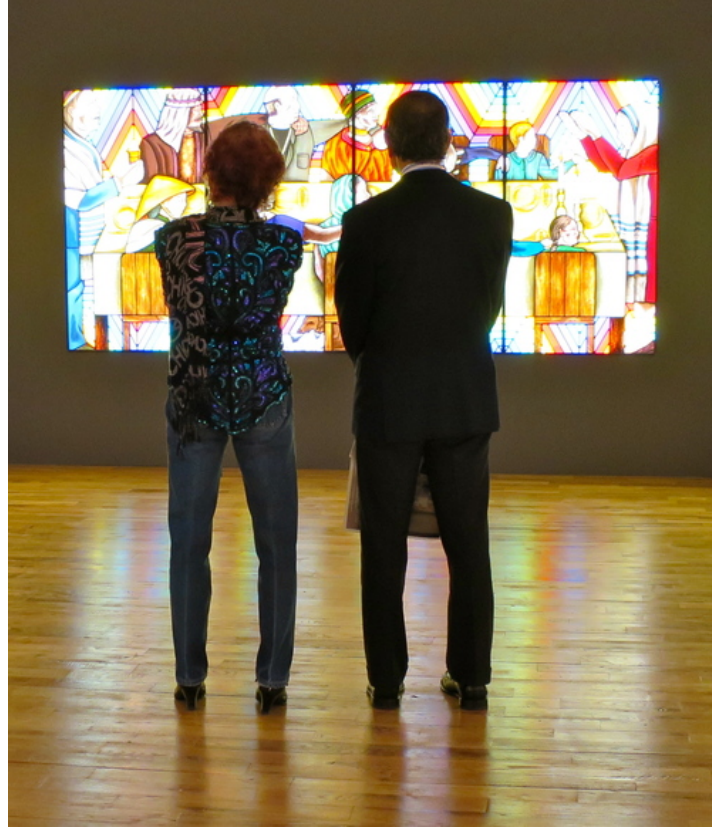
Judy Chicago and Jeffrey Deitch are seen reflecting on Chicago's work.