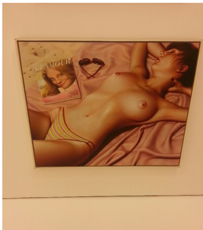
Another erotically-charged work from Photorealism Revisited.