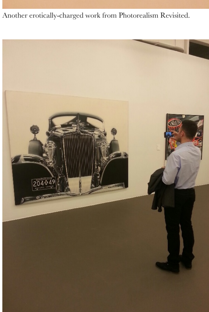
A spectator admires a work from Photorealism Revisited.