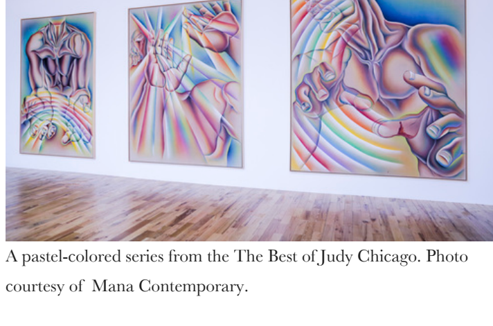
A pastel-colored series from 'The Best of Judy Chicago'.