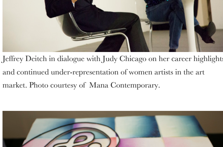
Jeffrey Deitch in dialogue with Judy Chicago on her career highlights and continued under-representation of women artists in the art market.