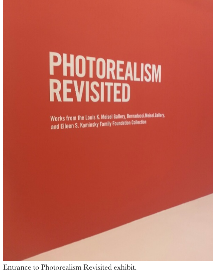
Entrance to Photorealism Revisited exhibit.