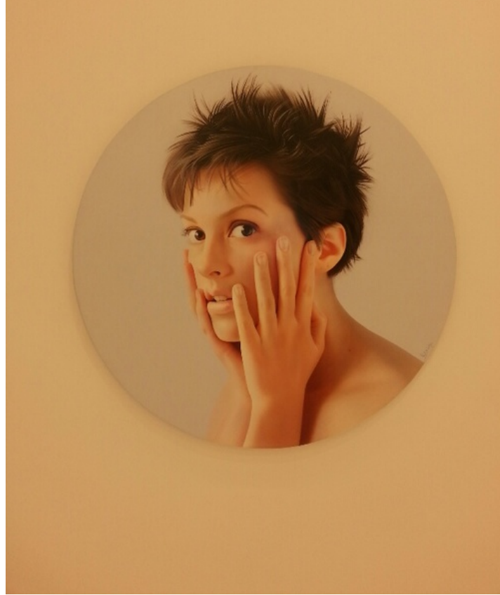
A sensual work from Photorealism Revisited.